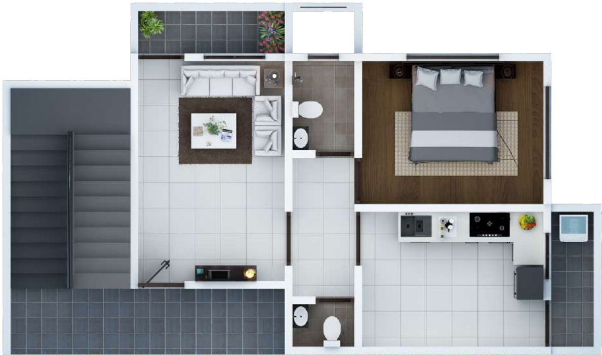
1 Bhk Apartment Plan